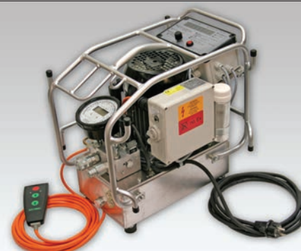
JETSTREAM 115/230 TORQUE &amp; ANGLE